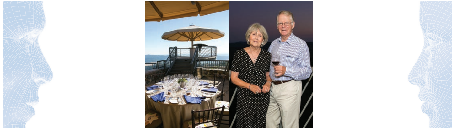
Côte Deux Mille