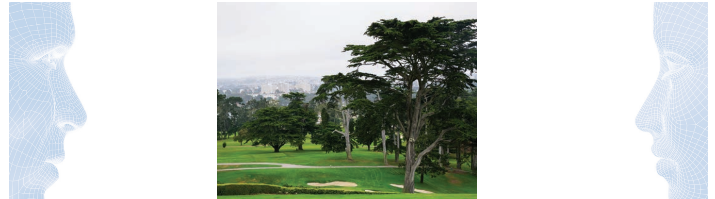
The Olympic Club

Olympic Club, Lakeside | San Francisco, CA | Chef Dominique Crenn, Atelier Crenn