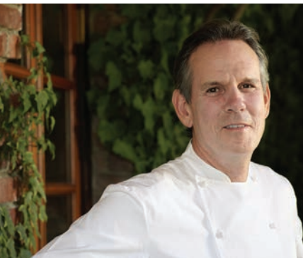
Chef Thomas Keller, The French Laundry, Per Se and Bouchon