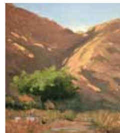
Good Day Sunshine, 20 X 16