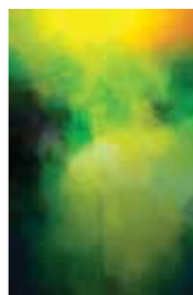
On The Edge of Time, 72 X 48