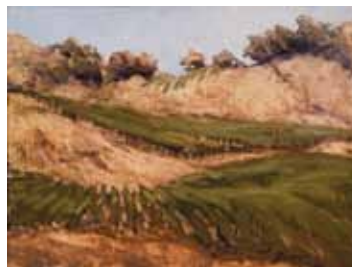
Vineyard on a Hill, 9 X 12