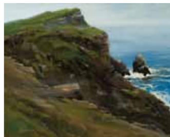
The Ravages of Time, 16 X 20