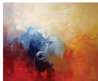
Figure of Speech, 48 X 60